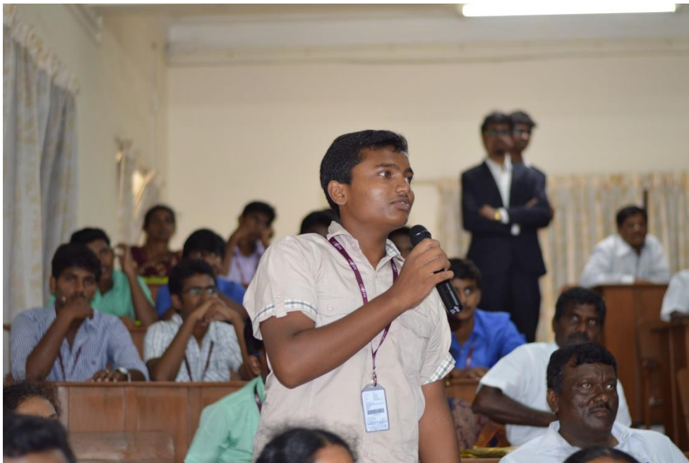
STUDENTS INTERACTING WITH EXPERTS IN A GUEST LECTURE