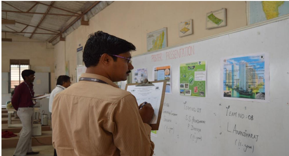
JUDGES EVALUATING THE STUDENTS POSTER PRESENTATION